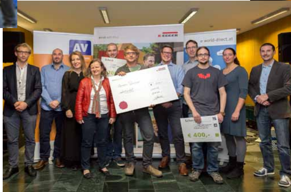
Presentation of the research results at inDay students